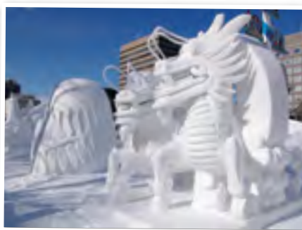
Sapporo Snow Festival

Note: The above event is organised by the local authority and is subject to change or cancel without prior notice.